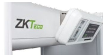
◀ Metal bracket