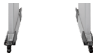
◀ Universal wheel