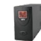
◀ Power supply and linkage interface